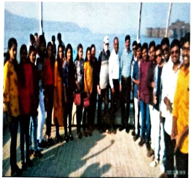
VISIT TO MURUD-JANJIRA FORT