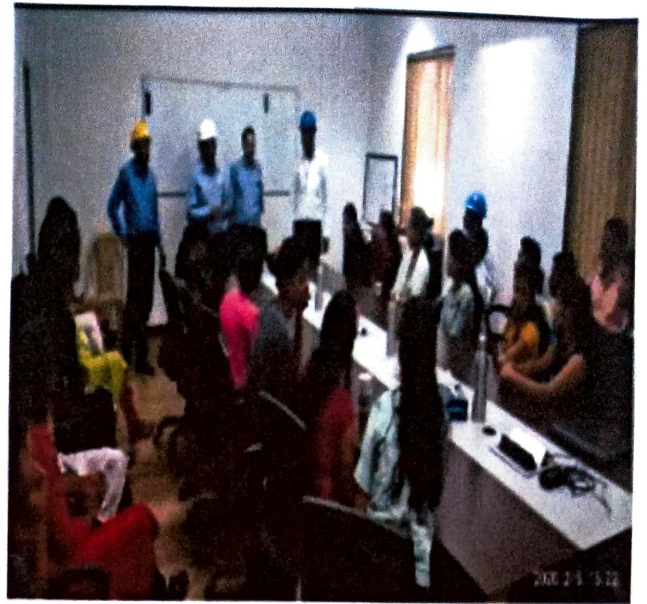
VISIT TO DEEPAK NITRITE LIMITED ROHA-DIVISION